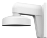
DS-1272ZJ-110-TRS Wall Mounting Bracket