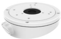
DS-1281ZJ-S Inclined Base Mounting Bracket